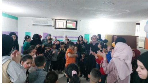
FGC Saïda, Eid celebration day.