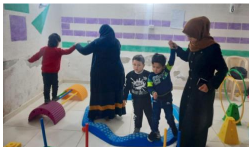
Activity day in Family Guidance Center Saida.

114 children with MSN and their caregivers benefitted from the service 2021-2022 in local FGCs: Beirut 39 children, Saida 20, El-Buss 15, Beddawi 21, Nahr el Bared 19. The number of special schools available by area were: Beirut 18, Saida 5, El-Buss 3, Beddawi 4, Nahr el-Bared 3 (see Appendix). By gender the children (n=114) were 68 % boys and 32 % girls. Most of them (82 %) were continuing their education and treatments as existing beneficiaries while 18 % were new beneficiaries. 91% were Palestinians living in Lebanon (PRL) and 9% were displaced Syrian children.